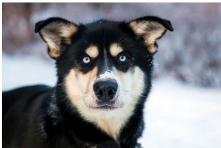
Figure 1: Lava the sled dog.